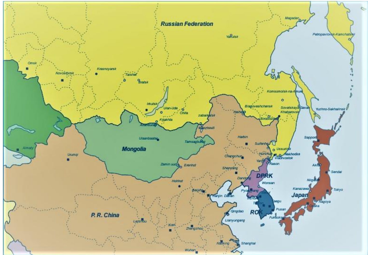
Suren Badral, NEAMF Advisor

(APPROXIMATE NUMBER with an error margin of \pm 2 )